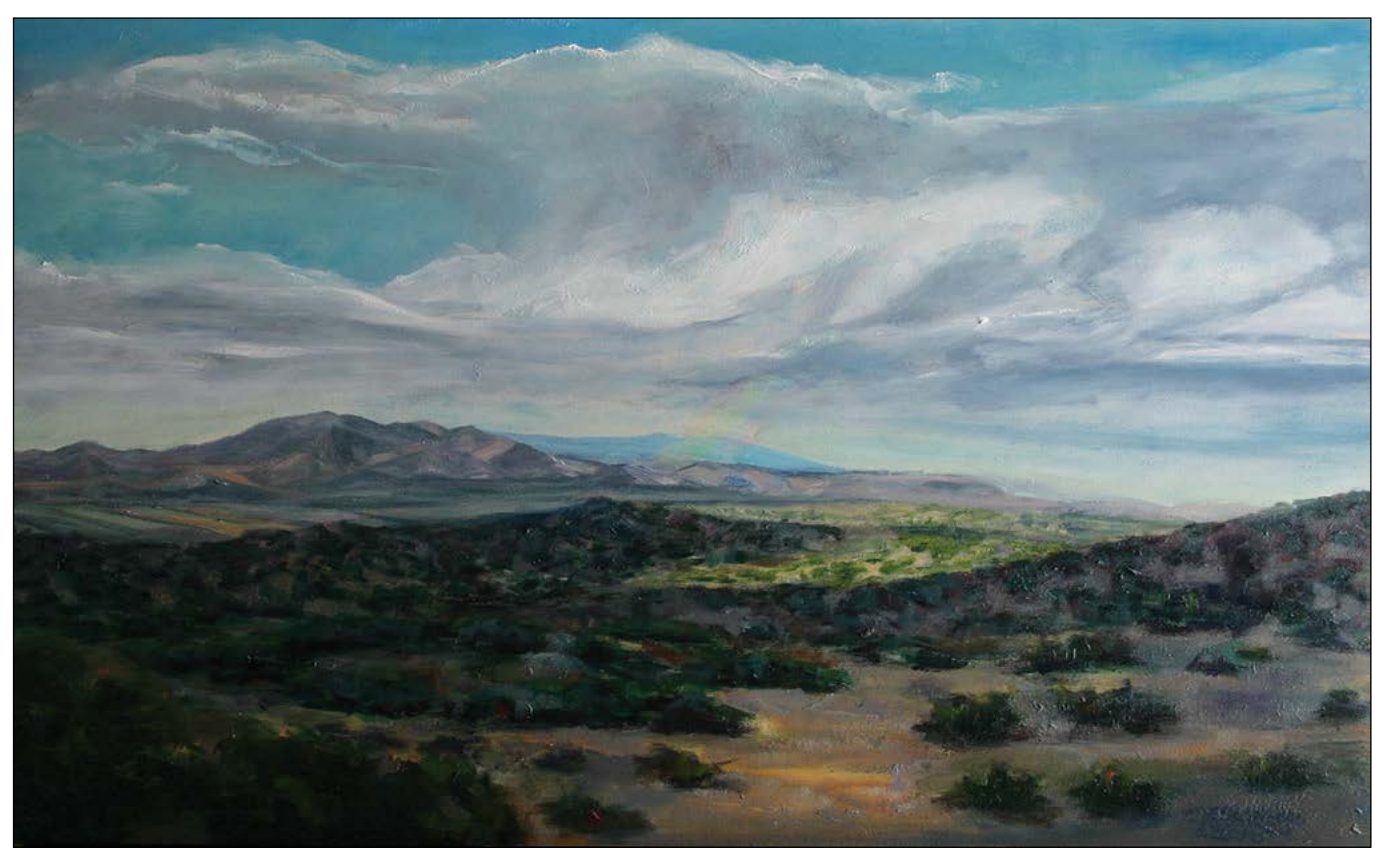
After the Rain, by Claire Hurrey (see page 3)