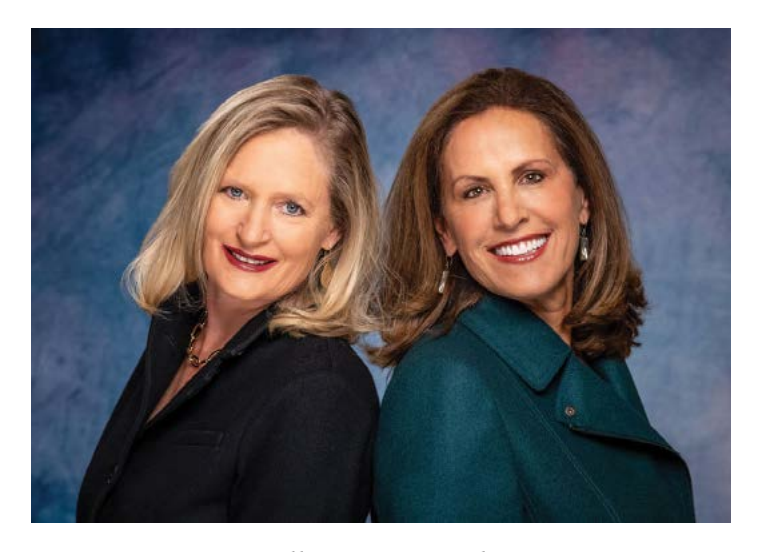
Serving Albuquerque and Santa Fe